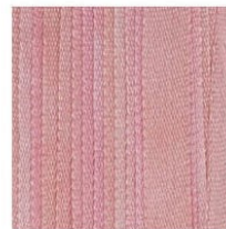
Coral SKU: S-86