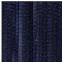
Water Lily SKU: S-70