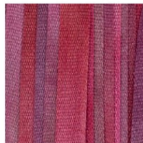
Stocks SKU: S-79