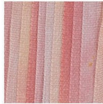
Antiquity-B SKU: S-44B