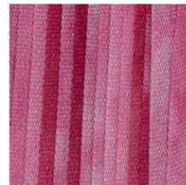
Wineglow SKU: S-45