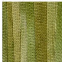
Holly SKU: S-56