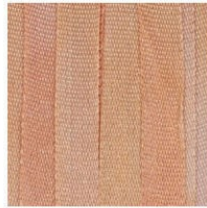
Antiquity SKU: S-44