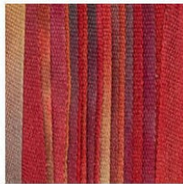
Freesia-C SKU: S-48C