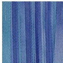
Water Lily-B SKU: S-70B