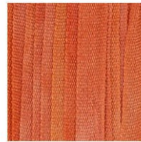
Good on Black-B SKU: S-89B