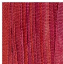
Berries SKU: S-20