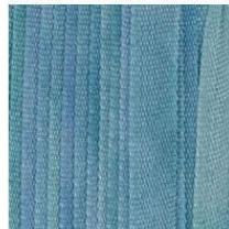
Verdon SKU: S-87