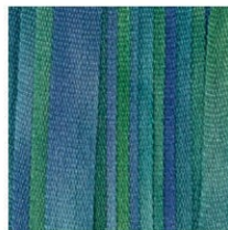
Aquatic-M SKU: S-28M