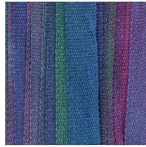
Peacock SKU: S-38