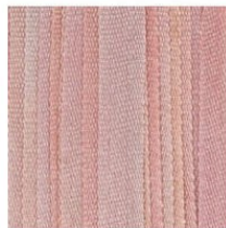
Roses-L SKU: S-16L