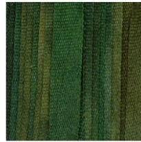
Bush SKU: S-08