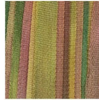
Freesia SKU: S-48