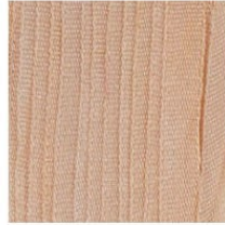
Tropicana-C SKU: S-85C