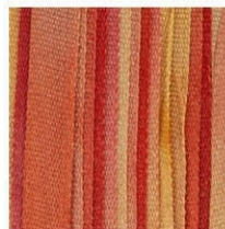
Autumn-A SKU: S-13A