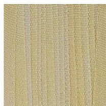
Sunlight SKU: S-11