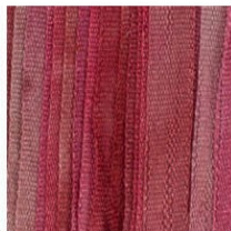
Snaps SKU: S-60