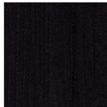
Wildlife SKU: S-66