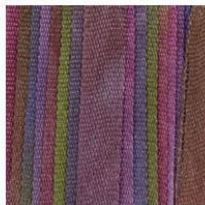
Hellebore SKU: S-62