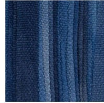
True Blue SKU: S-01