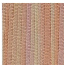
Blossom-A SKU: S-12A