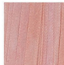
Blossom SKU: S-12