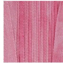
Camelia SKU: S-35