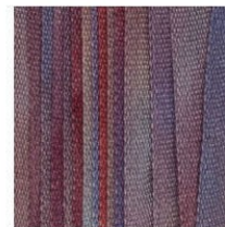
Aster-C SKU: S-19C