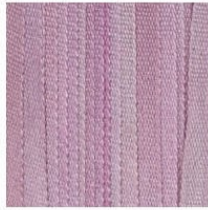
Pansy SKU: S-15