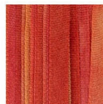
Flame SKU: S-43

To order call (818) 999-6094 or email Leora at info@aflembroidery.com