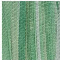
Periwinkle SKU: S-07