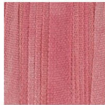
Fuchsia-B SKU: S-49B