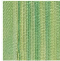
Apple SKU: S-67