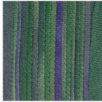
Forest SKU: S-54