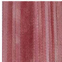
Tulip SKU: S-93