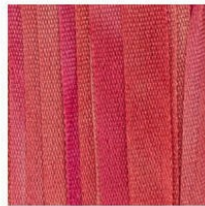
Camelia-B SKU: S-35B