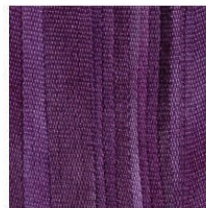
Aster SKU: S-19