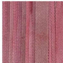
Plum SKU: S-23