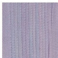
Fairies-C SKU: S-17C