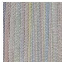
Birch SKU: S-84