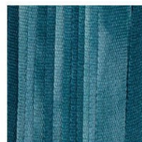
The Sea SKU: S-36

To order call (818) 999-6094 or email Leora at info@aflembroidery.com