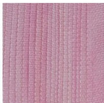
Wineglow-C SKU: S-45C