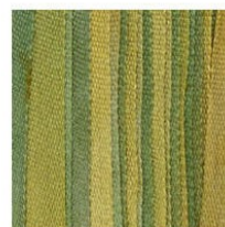
Fern-B SKU: S-04B