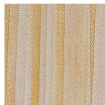
Desert Sands SKU: S-42