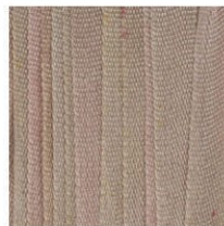
Ash SKU: S-74