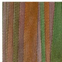
Cloves SKU: S-55