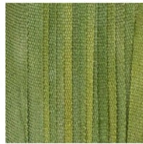
Golden Privet SKU: S-06