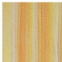
Daffodil SKU: S-47