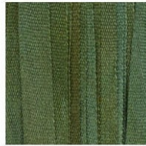
Bulrush SKU: S-03