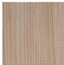
Autumn SKU: S-13