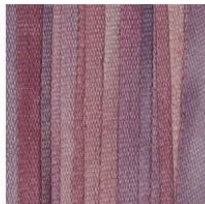
Granny SKU: S-99