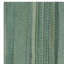
Cypress SKU: S-50