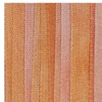
Coppertone SKU: S-37