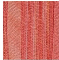
Good on Black SKU: S-89