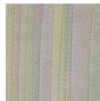
Fairies-B SKU: S-17B