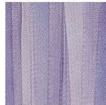
Viola SKU: S-14