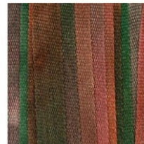
Harvest SKU: S-64