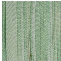
Periwinkle-C SKU: S-07C