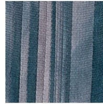
Forget Me Not-M SKU: S-21M