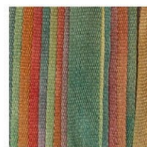
Brass-A SKU: S-46A

To order call (818) 999-6094 or email Leora at info@aflembroidery.com