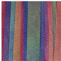
True Blue-C SKU: S-01C