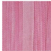
Camelia-C SKU: S-35C