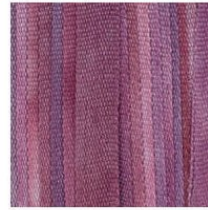
Peacock-C SKU: S-38C