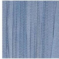
Forget Me Not SKU: S-21