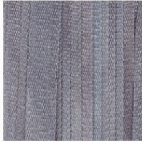
Touch of Grey SKU: S-27