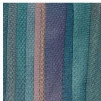
Reflections SKU: S-88