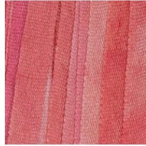
Tropicana SKU: S-85