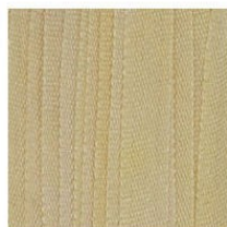
Sunlight-B SKU: S-11B