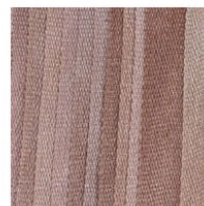
Desert Sands-B SKU: S-42B