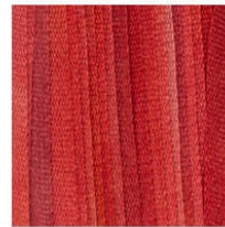
Christmas Red SKU: S-40