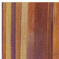
Strelitzia-B SKU: S-68B