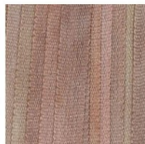
Winter SKU: S-41