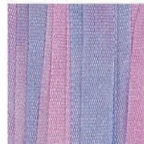
Hydreanga SKU: S-18