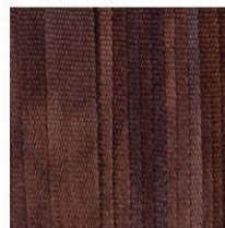
Bark SKU: S-72