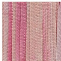
Roses-M SKU: S-16M