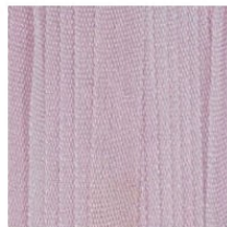
Spring SKU: S-94