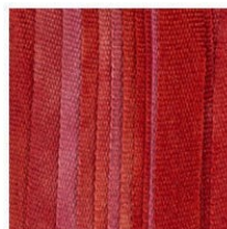
Berries-M SKU: S-20M