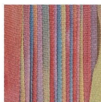
Blossom-C SKU: S-12C