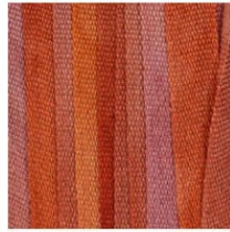
Papaver SKU: S-75