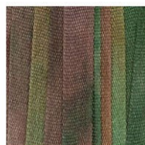
Fern SKU: S-04