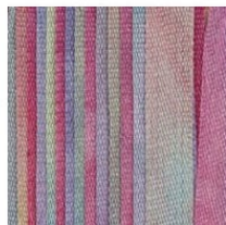
Wineglow-M SKU: S-45M