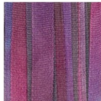
Grapes SKU: S-39