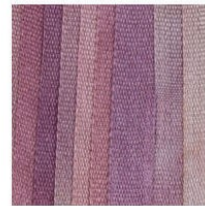
Clematis SKU: S-63