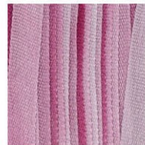
India SKU: S-52

To order call (818) 999-6094 or email Leora at info@aflembroidery.com