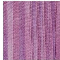
Fuchsia-C SKU: S-49C