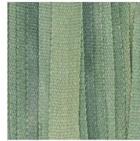
Cabbage SKU: S-30