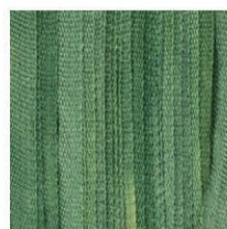
Blue Gum SKU: S-05