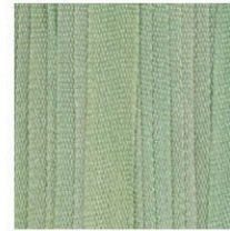
Aquatic SKU: S-28