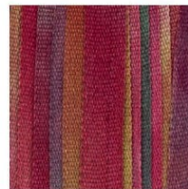
Salvia SKU: S-78