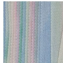
Grapes-C SKU: S-39C