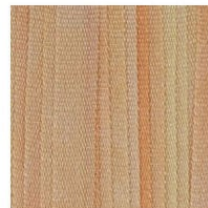
Strelitzia SKU: S-68