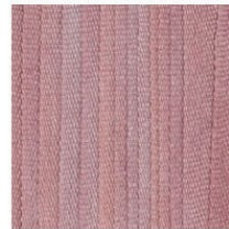
Plum-C SKU: S-23C