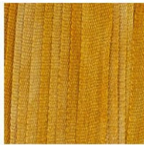
Gold SKU: S-26