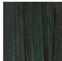
Woodlands SKU: S-69

To order call (818) 999-6094 or email Leora at info@aflembroidery.com