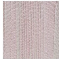
Gladiolae SKU: S-77